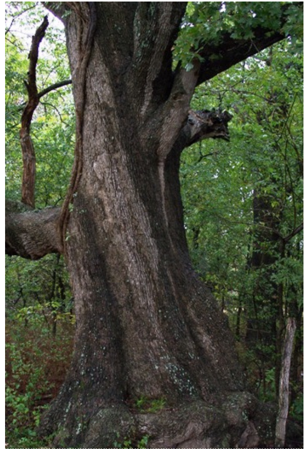
- Champion Post Oak –