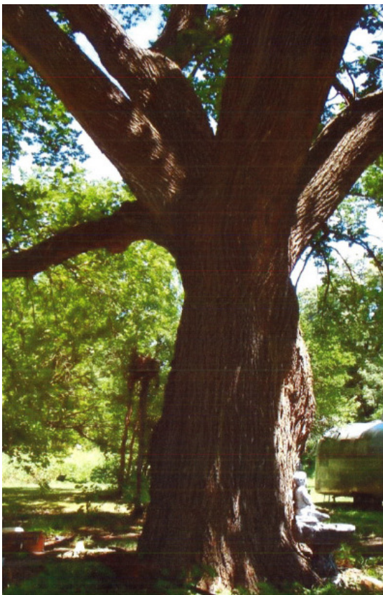
- Champion American Elm –