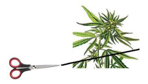
Figure 1. Illustration showing where cut should be made below flowering