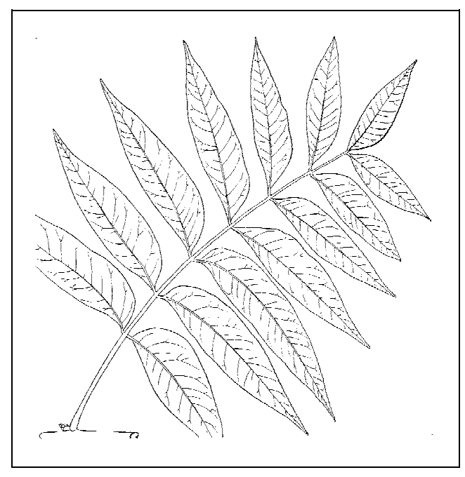
Figure 3. Foliage of Chinese Pistache.