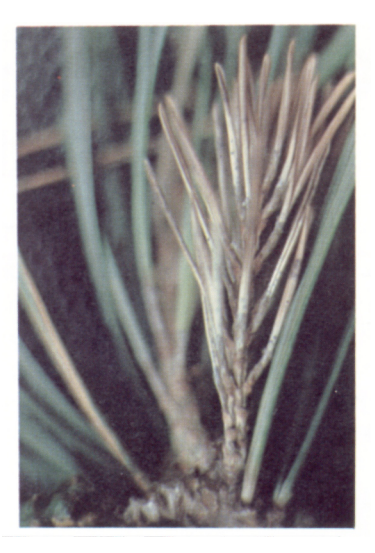
Figure 2. Stunted terminal branch of pine infected with Diplodia pinea .

Small black elliptical fruiting bodies of the fungus are produced on the needles. These structures break open in the late spring or early summer during periods of wet weather and release great numbers of spores. The spores can be spread by splashing rain or wind to infect other needles or trees.