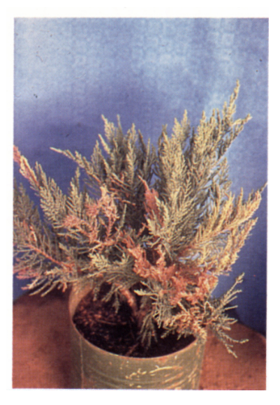
Figure 4. Juniper seedling infected with Phomopsis blight.

The disease is typified by the rapid death of the pine tree. if the wood is cut from these trees, the wood will be dry and no pitch flow will be noted. These symptoms should not be confused with the slow decline of pines that may result from drought conditions. Needles of drought stressed trees will turn brown and die, but the tree may put on new growth, and pitch will flow when the wood is cut. Several species of pines