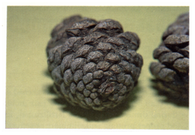
Figure 3. Pine cones infected with Diplodia pinea. The small black dots on the pine cone scales are fruiting bodies of this fungus.

usually have more severe disease problems because wetting of the foliage results in earlier spread of the conidia.