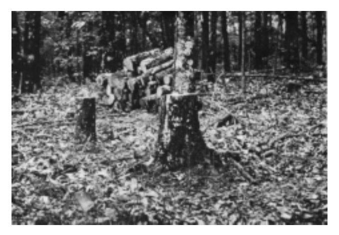
Intermediate cuttings, such as this thinning of an oak forest, can allow a landowner to improve a stand of trees, while realizing income from selling commercial products such as firewood or pulpwood. Reforestation plans should be made prior to harvesting timber.

Uneven-aged regeneration cuts (selection and group selection) are used to remove mature and undesirable trees from a stand while providing growing space for future regeneration. The selection of trees to remove can have a dramatic impact on the value of the sale as well as productivity of the remaining stand. The practice of removing all trees larger than a certain diameter should generally be avoided. The trees to be removed should be marked individually at breast height (4.5 feet) and on the stump. Typically trees are all marked on the same side, i.e. the north side, towards the road, or on the uphill side. This will make it easier for the logging crew to locate trees slated for removal. A professional forester can provide valuable assistance in a selection harvest. Caution must be observed to prevent damage to the residual stand during the logging operation.