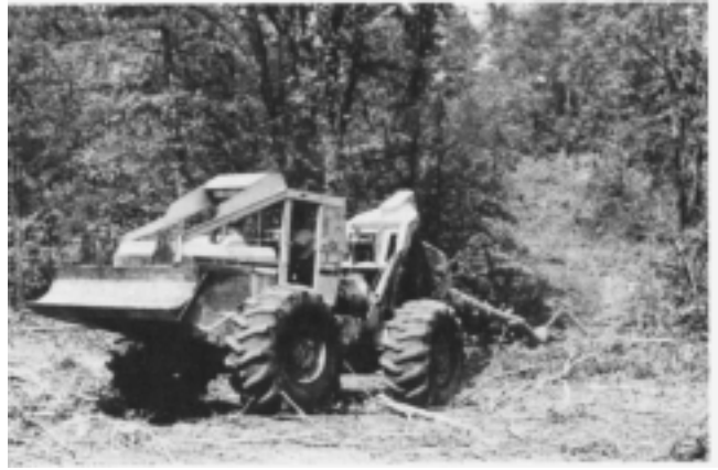
Harvesting timber can be a profitable venture for forest landowners. Care should be taken; however, in developing a management plan that identifies your objectives and incorporates Best Management Practices.