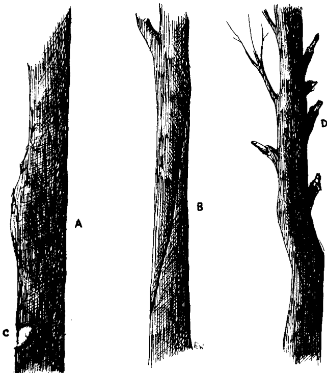
Figure 3. Crop trees should not have: A) Swollen stem, B) Seams or breaks in the bark, C) Mechanical wounds caused by logging or other equipment, or D) Poorly healed branch stubs. All of these defects indicate internal damage or disease. Such affected trees and crooked trees are best removed for firewood