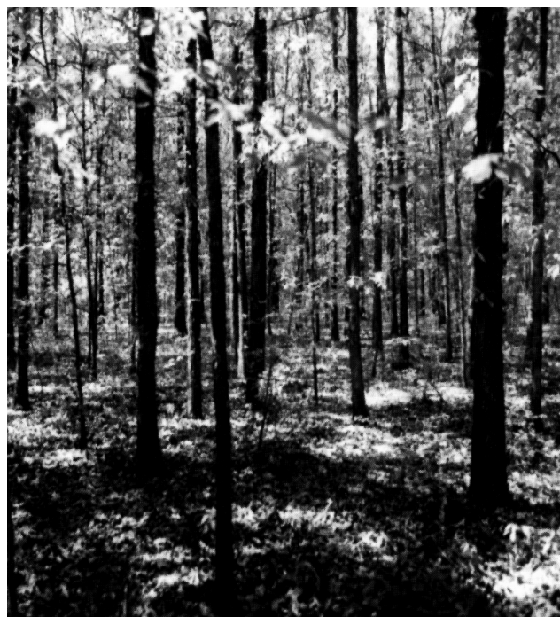
Figure 1. Trees, like crops, need space to grow. Thinning a high quality hardwood stand will improve its ability to produce sawtimber while providing landowners with plenty of firewood.

Wood volume is measured in standard cords. One standard cord takes up 128 cubic feet and contains approximately 80 cubic feet of solid wood. For detailed information on measuring firewood volumes, request OCES Extension Factsheet 9440: "Firewood: How to Obtain, Measure Season, and Burn" and 5021: "Measuring Woodland Timber" from your county Extension center.