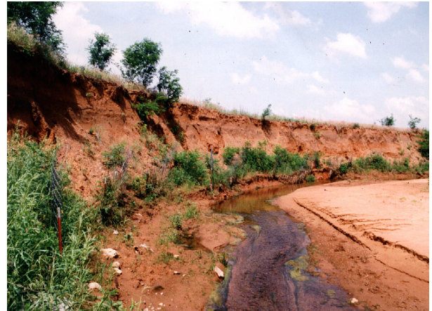
Figure 8d. Deflectors and trees on Stinson Creek early in 2nd growing season after installation. Plantings consist of black locust, ash, mulberry and shumard oak. The surviving trees are mostly black locust.