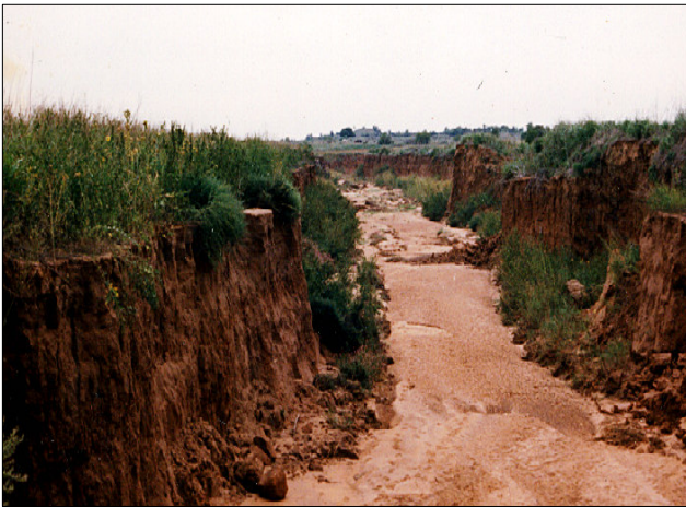
Figure 1. Large gully near Grandfield in Tillman County. Photo taken in 1990 before installation of the main drop-structure. The arms of this gully below the channel drop-structures range from 15 to 30 feet in depth and 50 to more than 300 feet in width.

Large gully systems typically begin with the development of a headcut in a shallow drainage on deep, silty or sandy soils as a result of drainage system changes. In such conditions, gullies may develop very rapidly. The Tillman County (Figure 1) and McClain County (Stinson Creek) (Figure 2) gully systems, discussed in this Forestry Note, were caused in each case by a deep headcut advancing up the channel through a distance of almost two miles within a period of 20 years. In both cases, the resulting erosion increased the channel cross-section ten-fold or more through their full length.