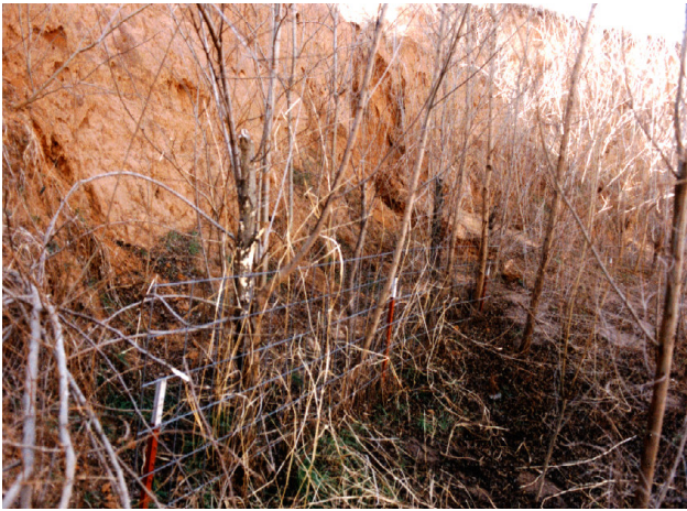
Figure 8a. Deflectors and black locust trees at location A on Figure 7. The trees are four years of age.