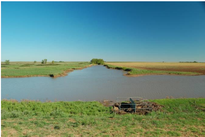
Figure 4a. Pond above the main pipe-and-dam drop-structure on the Tillman County gully system