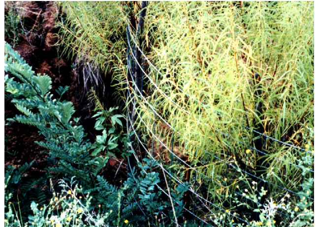
Figure 6c. Willow post growth at deflector

Where the deflector is installed on a wet site in early spring, fresh-cut willow posts can be used. Under favorable conditions, willow posts will root and grow into trees (Figure 6c).