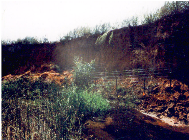
Figure 6b. Deflectors installed on the Stinson Creek gully. These are replacements (see Figure 8g). These deflectors are spaced 18 feet apart, center to center.

Where the deflector is installed on a wet site in early spring, fresh-cut willow posts can be used. Under favorable conditions, willow posts will root and grow into trees (Figure 6c).