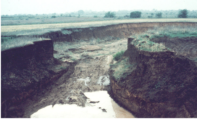
(Before Treatment) Original plunge pool and expansive, raw gully below Tillman County drop-structure in 1998