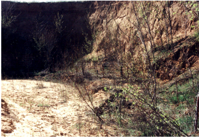
Figure 8b. Deflectors and black locust trees at location B in Figure 7. The trees are one year old.