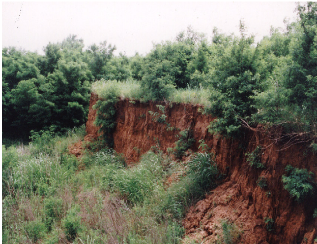
Figure 9a. Sprouting of exposed black locust roots on a Tillman County gully wall. These sprouts will become trees.