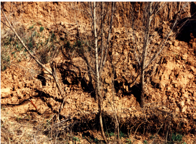
Figure 8c. Deflector at location B in Figure 7, pushed over by sloughing of the gully wall. The trees are two years old. The deflector and trees remain effective.