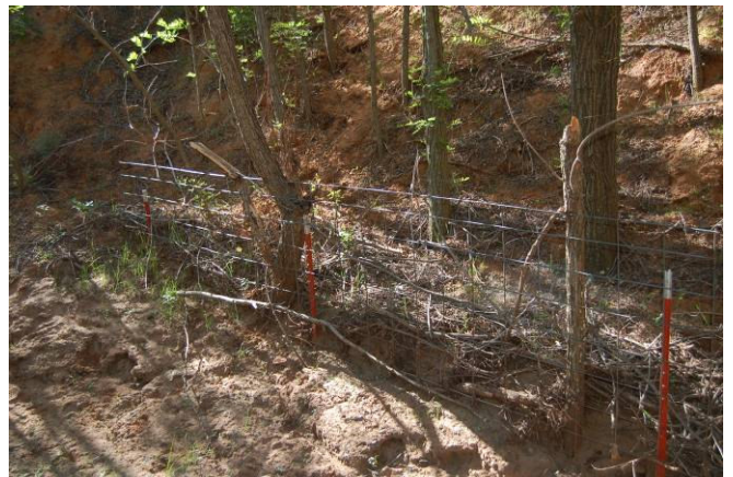
Figure 10b. Cattle panel deflector partially obscured by collected soil and planted trees, Tillman County gully (2006)