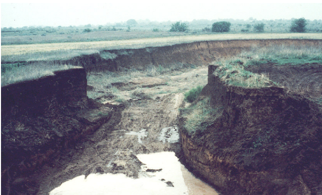
Figure 4b. Plunge pool and gully below the Tillman County drop-structure

Most of the sediment load of surface runoff is now deposited in the pond. This results in an increase in the erosive and sediment-transport energy of flows in the gully below the dam. These changes, in turn, accelerated development of a natural meandering channel in the gully bottom (Figure 5).