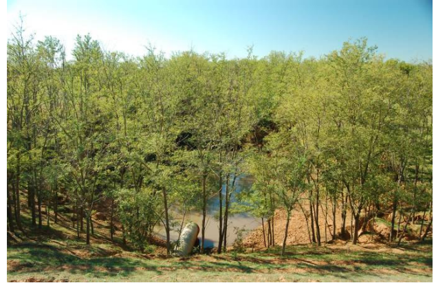
(After Treatment) Pipe outlet and stabilized gully under canopy of black locust trees below Tillman County drop-structure in 2006