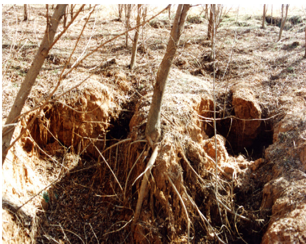
Figure 9b. Strong branching root system of black locust. Trees are 5 years of age on a moderately favorable site, and are about 4 inches in diameter at the base.

In most cases where the deflectors remained in place and helped the planted seedlings become established, gully erosion and bank sloughing have essentially stopped (Figures 10a and 10b).