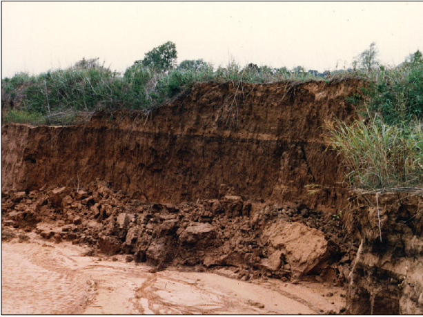
Figure 3. Fresh sloughing on the Tillman County gully, prior to the main drop-structure installation and tree planting and deflector treatments