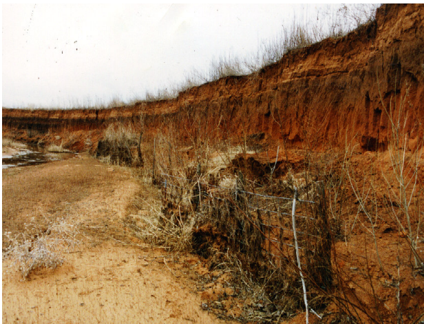
Figure 8g. Effective deflector installations on Stinson Creek in need of repair. The willow posts did not grow and more tree planting is needed. Deflectors on the toe in the left center were washed out and later replaced (see Figure 6b).