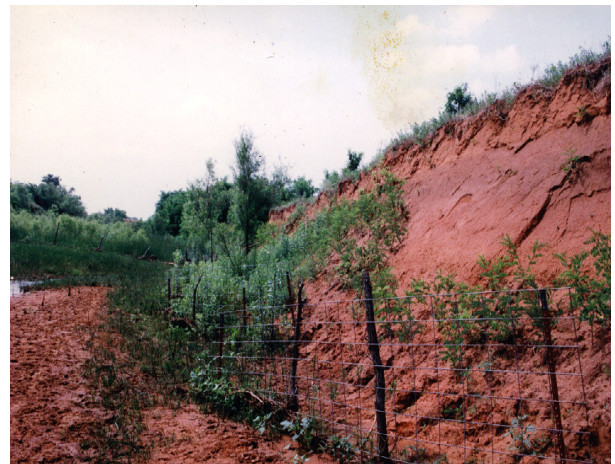
Figure 8f. The deflectors in Figure 8e, one year after installation. The black locust seedlings on the slope are in the first growing season, under favorable moisture conditions.