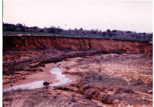
Figure 5. Small meandering stream channel developing on the Tillman County gully below the main drop structure

Most of the sediment load of surface runoff is now deposited in the pond. This results in an increase in the erosive and sediment-transport energy of flows in the gully below the dam. These changes, in turn, accelerated development of a natural meandering channel in the gully bottom (Figure 5).