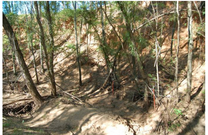
Figure 10a. Cattle panel deflector and trees on Tillman County gully effectively trapping sediment and stabilizing gully wall (photo taken in 2006)

In most cases where the deflectors remained in place and helped the planted seedlings become established, gully erosion and bank sloughing have essentially stopped (Figures 10a and 10b).