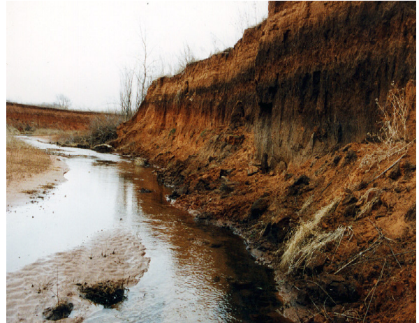
Figure 2. View of the Stinson Creek gully, McClain County, near its mid-point. The gullied channel ranges from 15 to 18 feet in depth and 70 to 120 feet in width.

when the soil becomes saturated during wet weather, and high runoff flows occur (Figure 3).