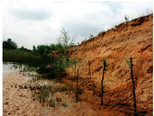
Figure 8e. Deflectors on Stinson Creek, using willow and steel posts. Note new branching on the willow posts. Black locust planted the previous season failed to survive because of dry weather.